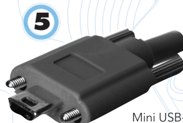
Mini USB-B w/Screws